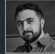
MUSTAFA SULEYMAN CoFounder, Deep Mind